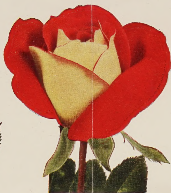
FORTY-NINER (Pat. 792)